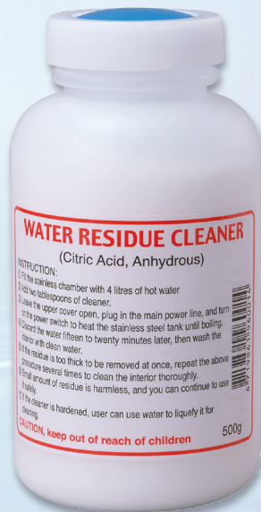
A bottle of 500 gram cleaner