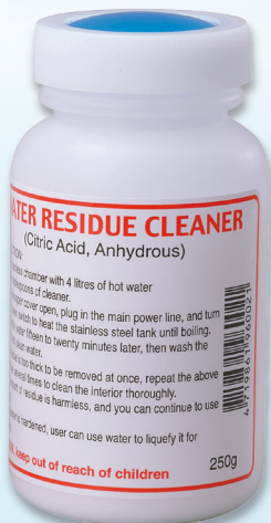
A bottle of 250 gram cleaner