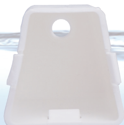
PP Nozzle (For PP bottle)