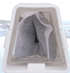
PP Nozzle + Glass Insert (For Glass bottle)