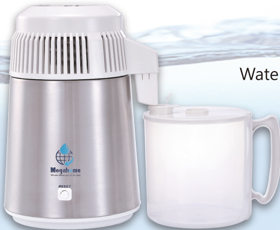
Water distiller + PP bottle