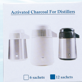
A package of 12 sachets

※ Used activated charcoal sachet can be re-used for odor removal by placing it in shoes or refrigerator.