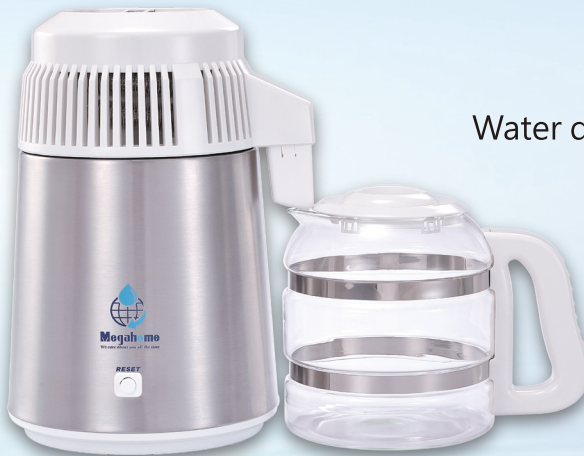
Water distiller + glass bottle

Please make sure the nozzle and the spout of water container (PP bottle or Glass bottle) are properly aligned to avoid water leaking.